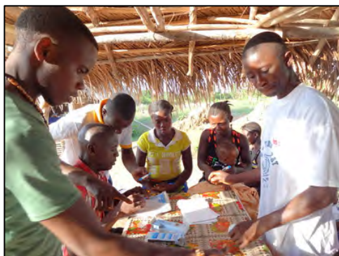
Above: Students working hard together to get patient information, collect small payment, and take the temperature of 180 patients.