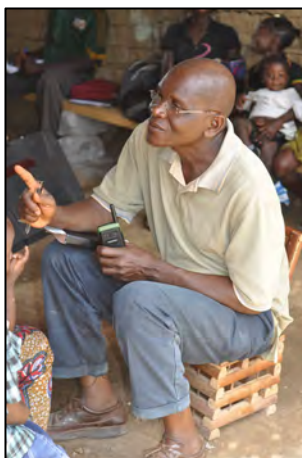
Top Middle: Patients waiting