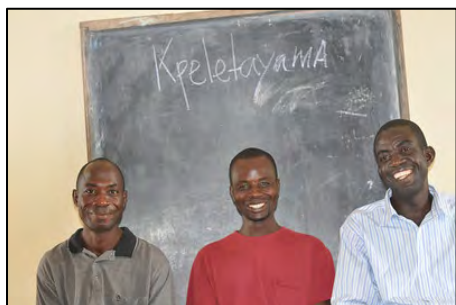
Team # 2 Kpellatayama