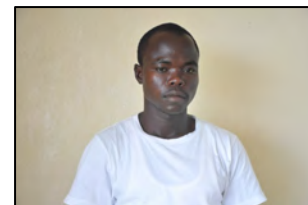
New Life Clinic