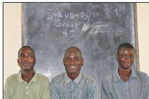
Team #5 Stand By

Please pray for these teams and individuals. They were given a lot of information and responsibility as a result of this training.