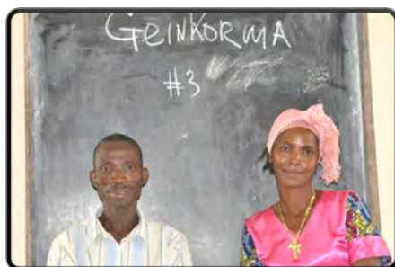
Team #3 Geinkorma