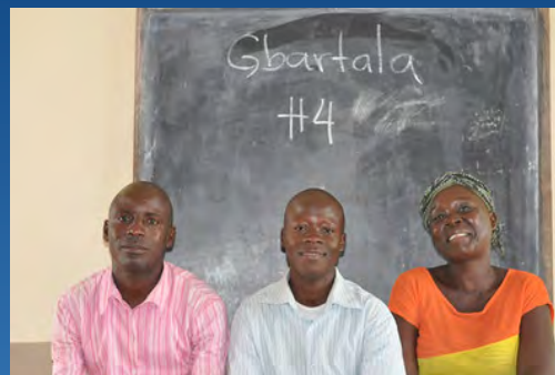
Team # 4 Gbartala